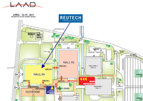
Layout Plan for LAAD 2011

Product support services include maintenance and repair, operational and technical training, installation, commissioning, system integration and qualification. Logistical support facilities include O, I and D-level maintenance solutions to suit the customers operational requirements. Other activities include joint development partnerships and Transfer of Technology ensuring local indigenisation and economic stimulus in country.